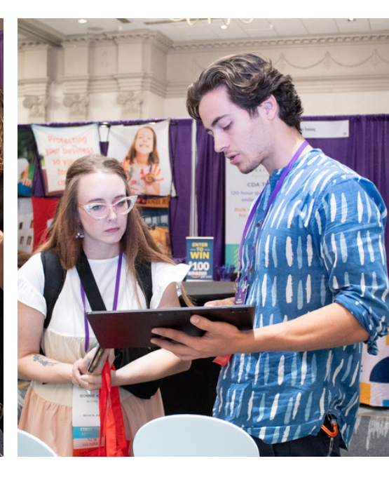
EXHIBIT HALL/VENDOR SCHEDULE**