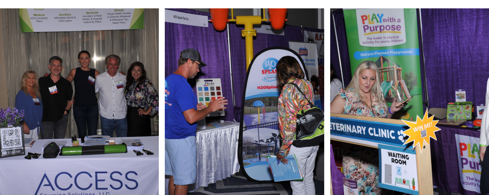
EXHIBIT HALL/VENDOR SCHEDULE