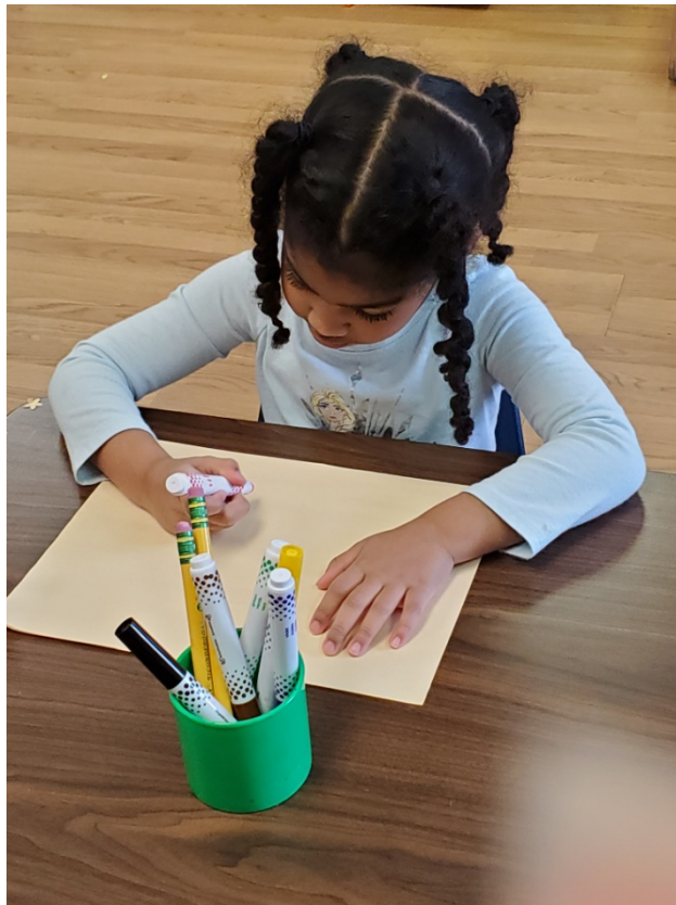
Individualized Art Materials