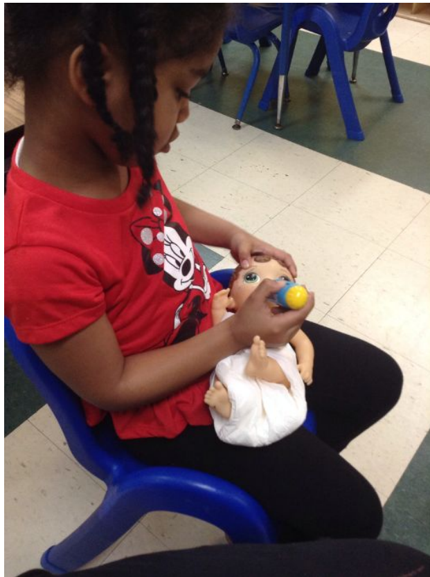
Plastic doll, bottle, and diaper